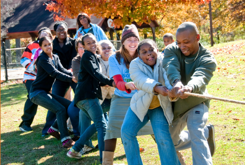
SOCM members and staff take part in a tug-of-war during the SOCM Annual Meeting, when members are invited to help set organizational priorities for the upcoming year.

SOCM currently works on local issues in ten counties across Tennessee and promotes several state-wide initiatives. Chapters are the building blocks of SOCM's democratic structure and grassroots approach. They can be city, county or regionally based. Chapters offer local residents a place to meet, discuss and address concerns. Chapters are effective in bringing about change in their communities