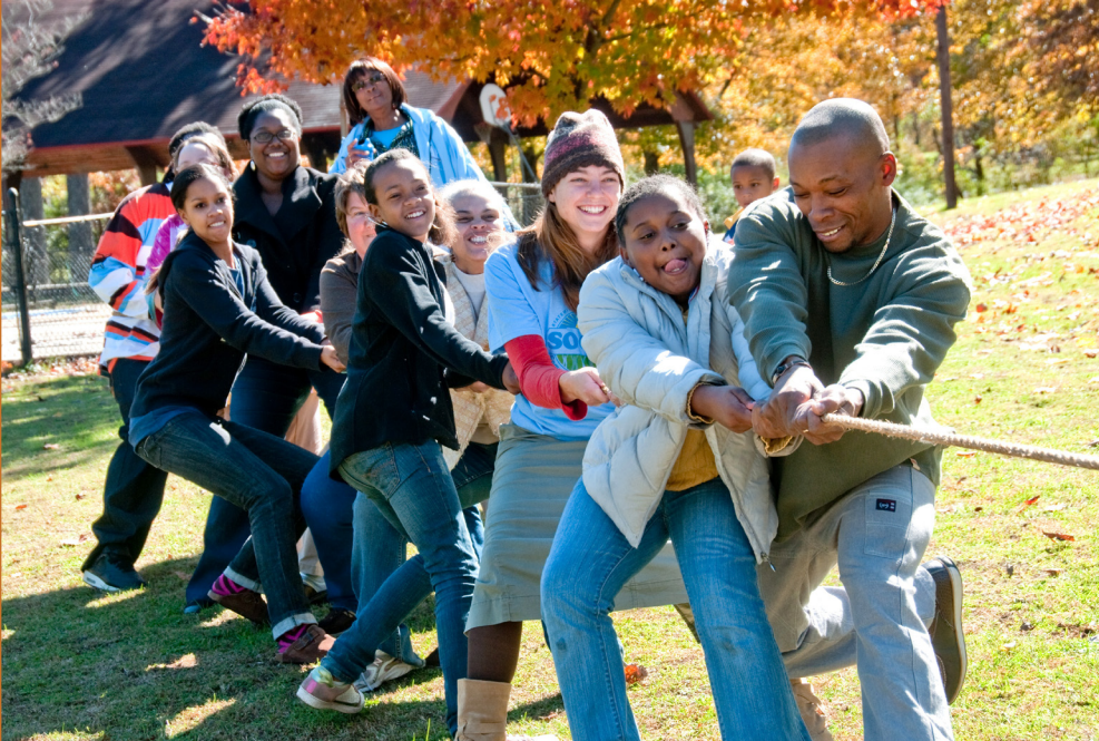
SOCM members and staff take part in a tug-of-war during the SOCM Annual Meeting, when members are invited to help set organizational priorities for the upcoming year.

Committees and chapters often work together to encourage successful campaign development and implementation at the local, state, and federal levels.